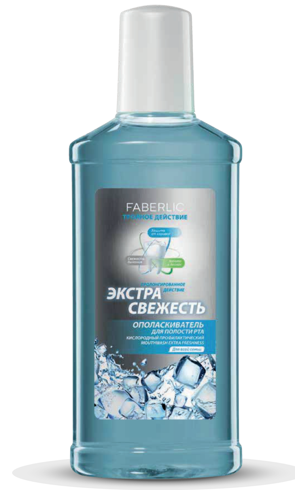
2293 Rinse aid Extra freshness Bright taste of menthol. Long-lasting freshness of breath, effective protection against caries Volume: 250 ml