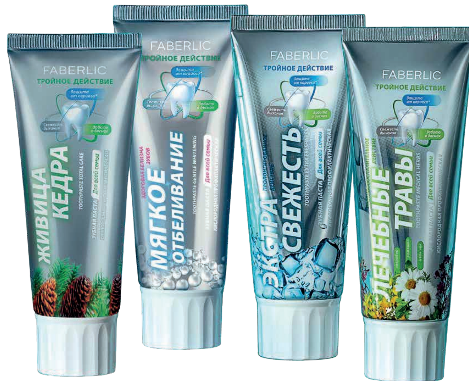
2444 Cedar sap Pine taste. Prevention of caries and diseases of oral cavity