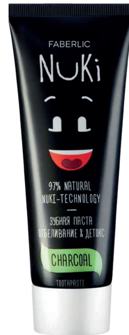
2212 Whitening and detox Charcoal