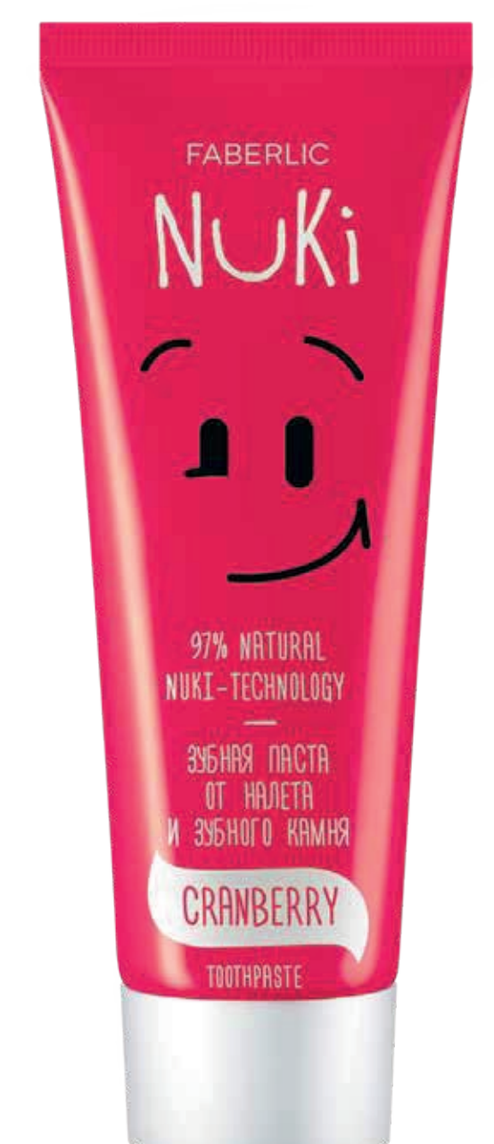
2658 From plaque and tartar Cranberry