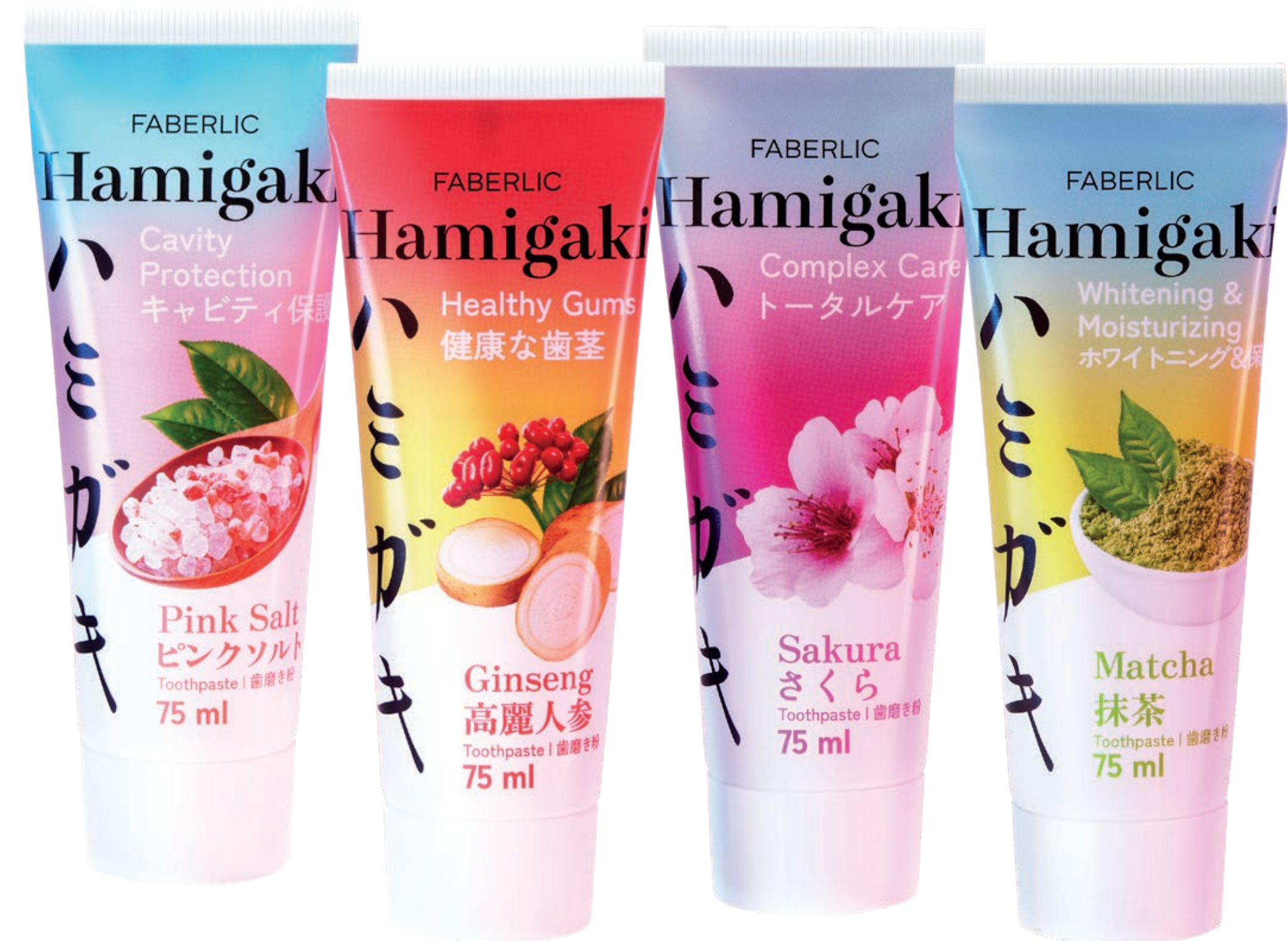
2673 Protection from caries Pink salt