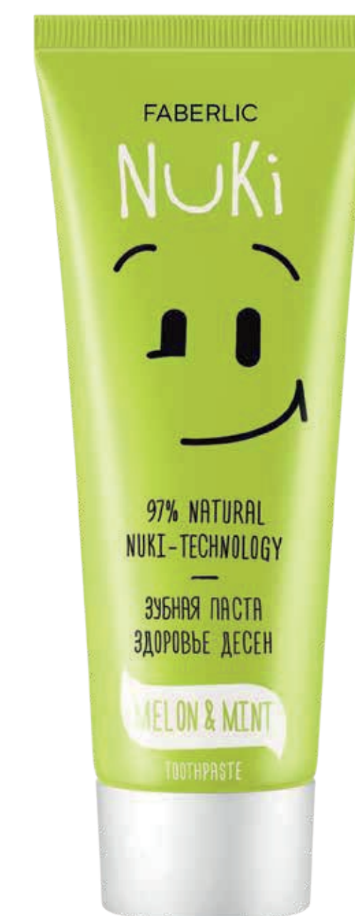
2496 Gum Health Melon