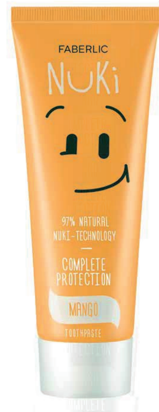
2847 Comprehensive protection Mango