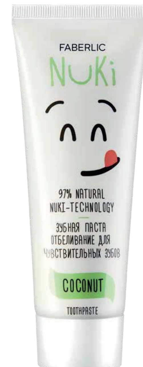
2214 Whitening for sensitive teeth Coconut