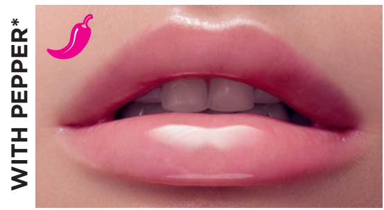
41027 pink quartz