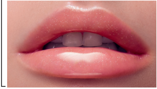
41129 glowing sunset