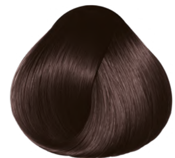
3.0 Dark Chestnut 3283