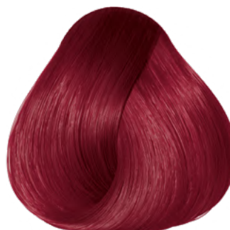
5.66 Ruby 3291

A bold decision for those who like to stand out and are not afraid to experiment!