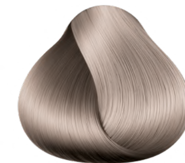
9.11 Very light blonde ash 3390