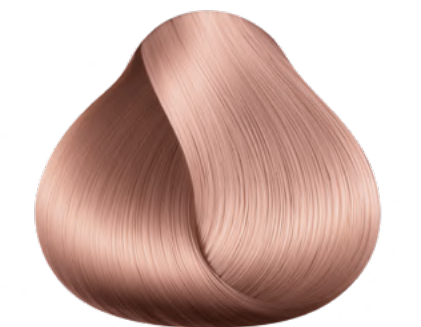
9.86 Very light blonde strawberry 3391