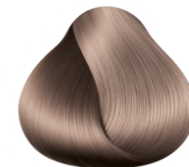
8.1 Light blonde ash 3352