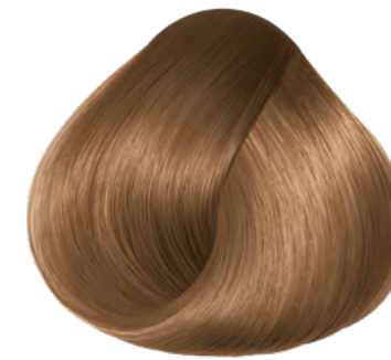
7.0 Blonde 3295