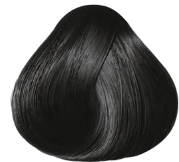
1.0 Black 3282