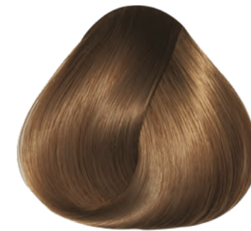
6.0 Dark blonde 3293