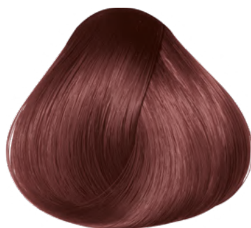
5.35 Light chestnut Chocolate 3290