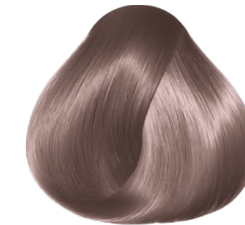
7.17 Blonde ash violet 3297