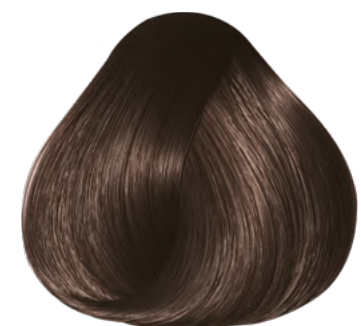
4.0 Chestnut 3285

A bold decision for those who like to stand out and are not afraid to experiment!