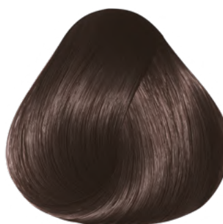
4.1 Chestnut ash 3286