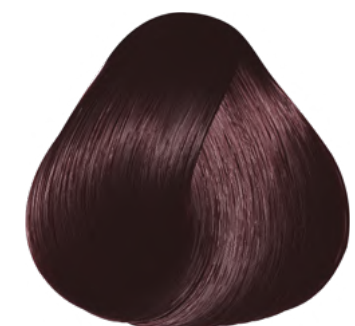
4.5 Chestnut Mahogany 3288