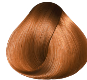
7.34 Blonde colden copper 3298