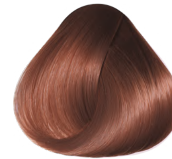
6.4 Copper chestnut 3294