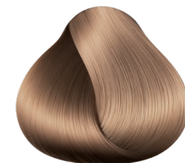
8.01 Light blonde natural 3299