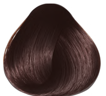
4.05 Chestnut Chocolate 3287