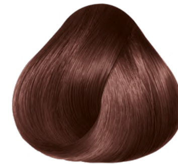
5.87 Chocolate 3292

The noble shade suits any color type, as it combines warm and cold nuances