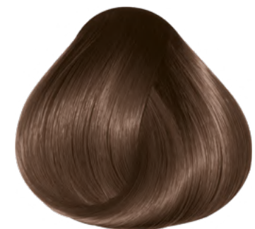
5.0 Light chestnut 3289