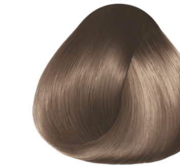
7.1 Ash blonde 3296