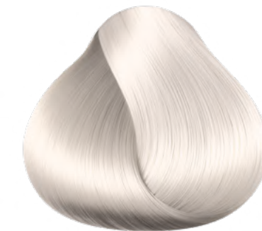
11.1 Ultra brightening blonde ash 3357